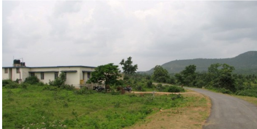
A primary health centre 3