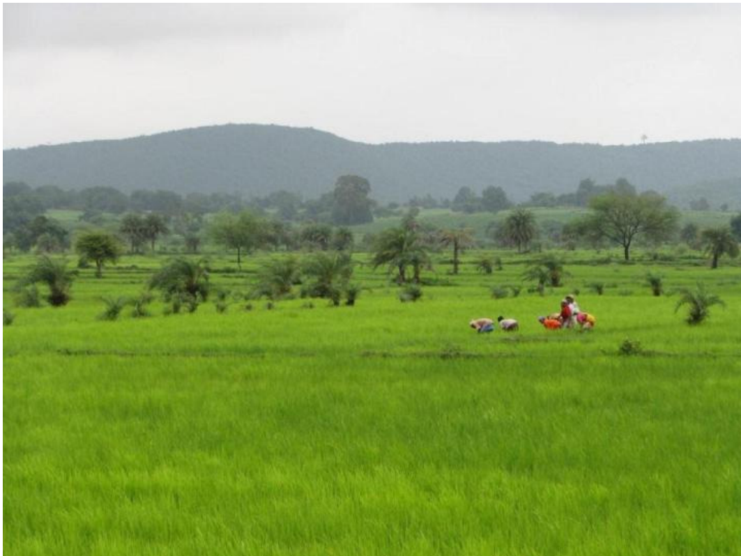
Paddy fields in a southern district

The study team had to travel for long hours to reach these locations, through vast stretches of fields and sometimes densely forested areas. The team was accompanied by local health officials or health workers who were well acquainted with the terrain and the location of the healthcare centres. During the visits, the team frequently came across sections of roads which had been destroyed (and recently repaired) by landmines reportedly planted by insurgents, an indicator of the environment of violence and militarization in many parts of the state. For a number of doctors and health care workers posted in areas affected by insurgency, personal safety is a major concern and cause of anxiety. Respondents and study facilitators reported several instances of violent clashes between insurgents, security forces and counter insurgents. In one instance, the team heard of the occurrence of an armed attack resulting in the death of several police officers, a few days after visiting the location. Paradoxically, many parts most affected by strife were also of exceptional scenic beauty, with their lush green landscapes and forest and mountain vistas.