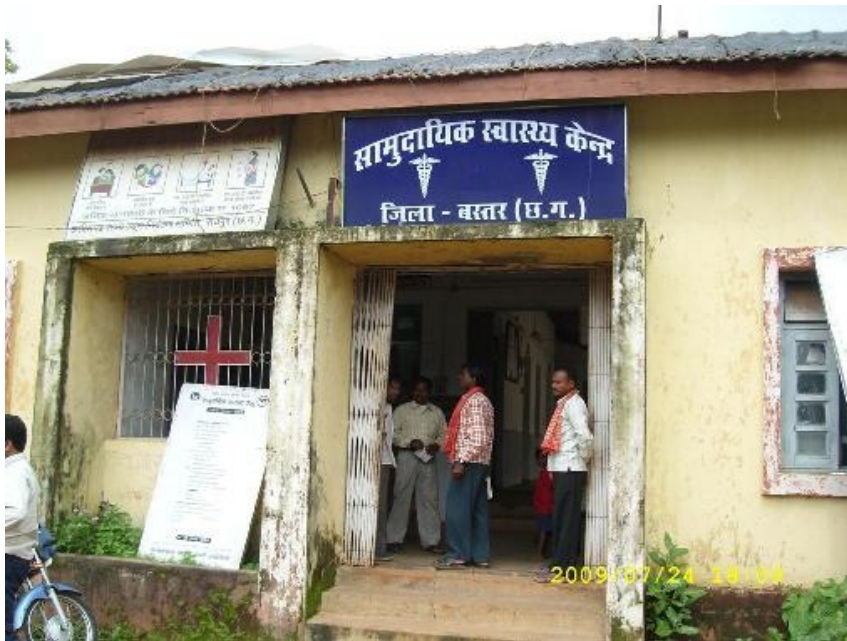
A community health centre 9

Some respondents spoke of the importance of adaptability to the different needs of patients in remote areas.