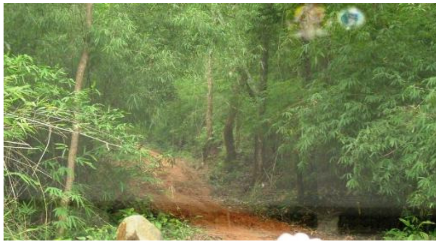
An unpaved road leading to a PHC