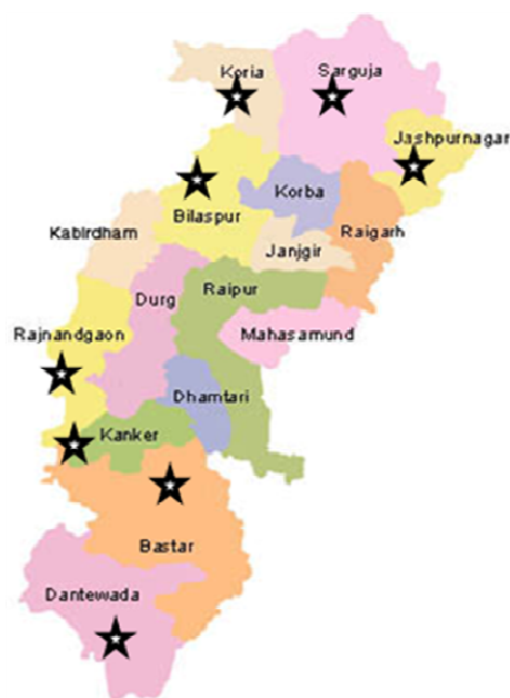
Figure 3 Interviews were conducted in eight districts

The study covered 14 CHCs and 23 PHCs located in remote and rural areas across eight districts in the state of Chhattisgarh. All the healthcare centres selected were distant from the district headquarters and poorly connected by any form of public transport. While some of the CHCs were adequately linked by roads, reaching the PHCs was often a problem as they were located deep in the rural interiors usually with unpaved roads. In many cases, the main means of public transport were jeeps, overcrowded with people and owned by individuals residing in the area. Healthcare workers posted in these locations generally rely on their privately owned vehicles and sometimes ambulances (if there is one in the healthcare centre) for travelling to block or district healthcare centres when called for meetings or other work related visits.