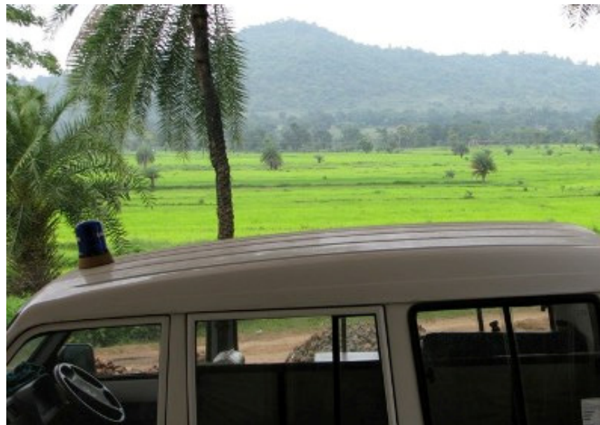
Vista from a community health centre