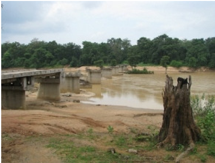
A bridge destroyed by insurgents 7

The threat of civil strife is pervasive in many parts of interior Chhattisgarh. Insurgent groups were widely feared – they were typically referred to in hushed tones as those “from inside” (Hindi: “andar wale”, a reference to their dwelling in camps deep inside the forests which cover large tracts of rural Chhattisgarh). However there is also a strong presence of counter-insurgent groups and armed forces of the government in these regions – and these, along with insurgency, represent a collective context of military presence and strife in the lives of villagers, and the insecurities experienced by health personnel.