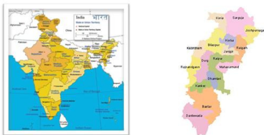
Figure 1 Districts of Chhattisgarh State